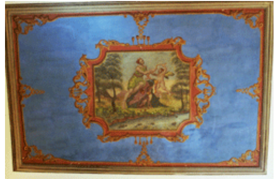
Fresco painting on the ceiling in the lounge. It is estimated to have been painted around 1750