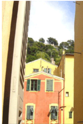
View of the Chateau Hill looking left from each bedroom window