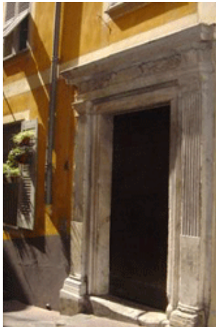
Majestic front door to the apartment building